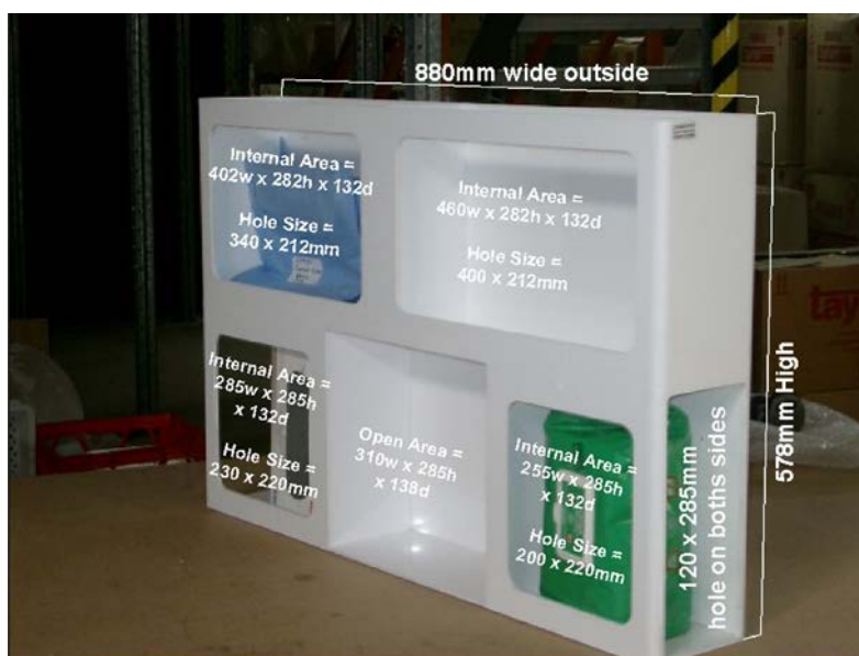
Figure 2: Example of a customized PPE container