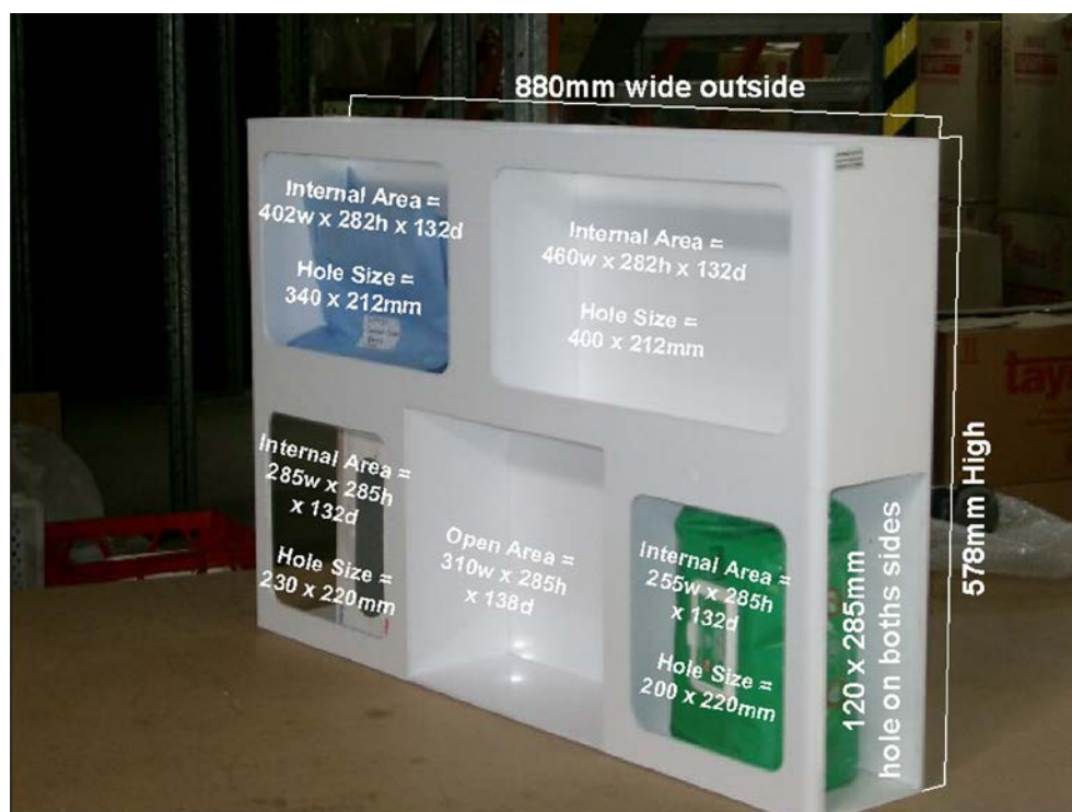
Figure 2: Example of a customized PPE container